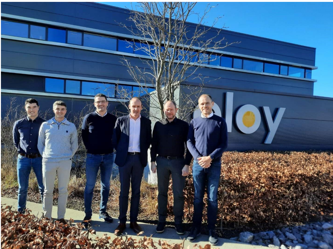
Eloy and Hoffmann Green management teams

In line with this approach, Eloy has signed a partnership with Hoffmann Green Cement to carry out specific technical tests and develop concrete formulations based on Hoffmann Green Cement 0% clinker technologies.